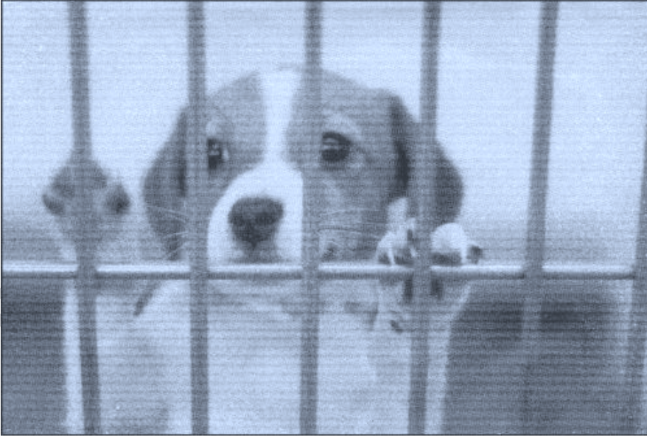
A Puppy in a Kennel